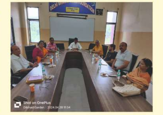
Shot on OnePlus Dilshad Garden 2024.04.28 11:54